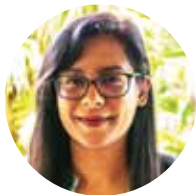
Benazeer Saidoo Mauritius Africa Fintech Hub